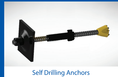
Self Drilling Anchors